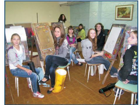
At the Polenova Art School in Tula, which has contributed hundreds of excellent art works to the Albany Tula Alliance, including themes of Russian fairy tales, American fairy tales, dance, and Tula City scenes. October 2010.

sary celebration. They discussed various projects and exchanges and all expect to continue expanding relationships.