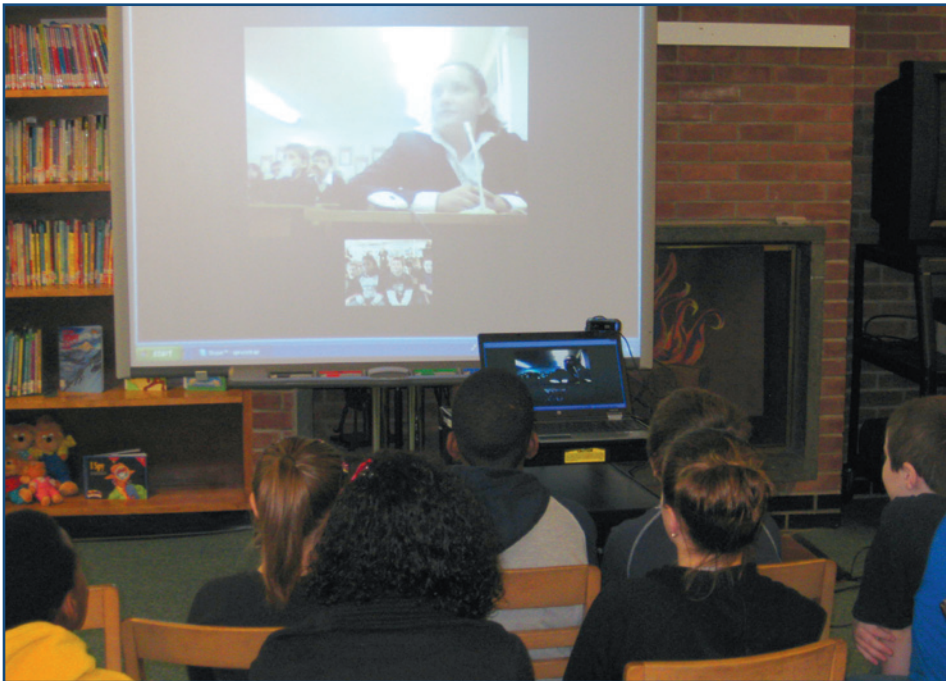
Team Information Explorers Program students meet via Skype with high school students from Tula School #3.

Schenectady High School School Library Media Specialist, and Teacher Leader, Team Information Explorers Program