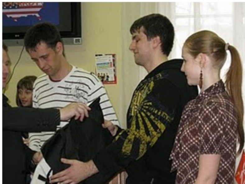
Olympiad Contestants at first American Studies Olympiad in Tula