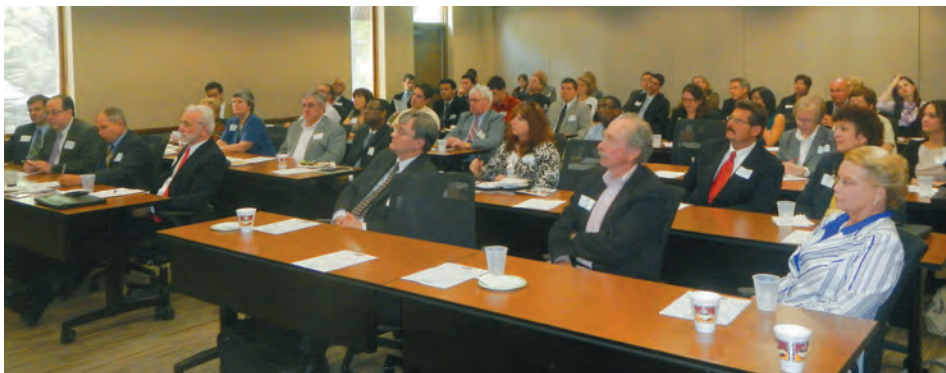
Attendance was strong at the Tech Valley Global Business Network (TVGBN) Russian business seminar.