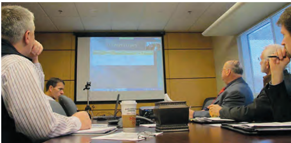
Capital Region and Tula entrepreneurs begin trade explorations via videoconferenced presentations.

Members of the Alliance Business and Economic Development Committee have continued to work with Tula State University this year to identify and support information exchange between potential trading partners. Tula State anchors the business